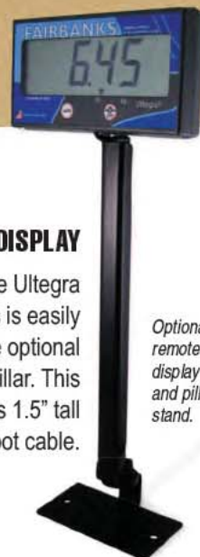
Optional remote display and pillar stand.

The remote display for the Ultegra and Ultegra Max scales is easily mounted to a wall or on the optional 18" tall remote display pillar. This LCD display features 1.5" tall characters and an eight-foot cable.